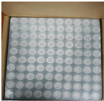
Small box 小箱