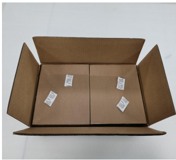
Big box 大箱