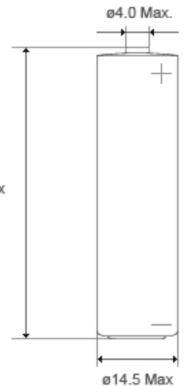
Dimensions in mm